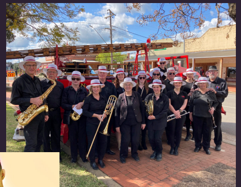
Riverina Concert Band brings together amateur and semi-professional musicians for a sensational performance of fruity bangers that'll keep you dancing all night long!

PLUS CHECK OUT LOCAL LGBTQIA+ AND ALLY TALENT PERFORMING ON THE COMMUNITY STAGE